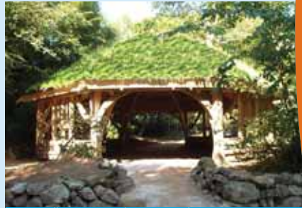
Roundhouse at Bishop's Wood Nature Reserve

from Gower woodlands in accordance with sustainability principles, designed and built by Dafydd Davies-Hughes and inspired by a study of a medieval cathedral spire.