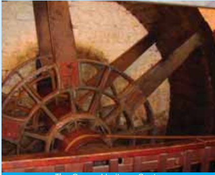
The Gower Heritage Centre

Singleton Botanic Gardens burn wood chip to generate heat which keeps the greenhouses at the right temperature.