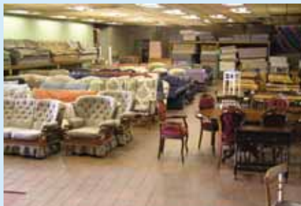
RESaREC furniture warehouse

RESaREC stands for Resettlement and Recycling. This project, run by Cyrenians Cymru, collects donated furniture and distributes it to homeless people and people on benefits and low incomes. The project also includes a paint re-use scheme and has a workshop where volunteers renovate furniture whilst learning woodwork and craft skills for themselves. The scheme provides the Celfi Gallery and Gift Shop (20 Mansel Street) with handmade furniture and crafts recycled from waste material.