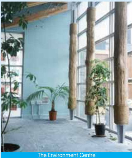
The Environment Centre

www.environmentcentre.org.uk/about_us provides more information on the eco-features.