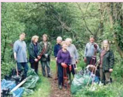
Mumbles Development Trust (MDT) volunteers

Acting in a sustainable manner as an individual is relatively straight forward, but the challenge is to create a sustainable culture in a shared context. Working together as a community is so much more powerful in terms of achieving sustainability on this planet. This could be as a family living sustainably together at home, it could be acting together with your colleagues in your work environment whether that's an office, school or outdoors, or it could be pulling together with your local neighbourhood community through communal venues or meetings. On the Sustainability Trail there are several projects demonstrating the positive impact of working together.