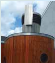
Ventilation system at the Environment Centre