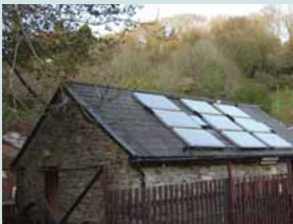
The Gower Heritage Centre

Today renewable energy accounts for less than 4% of the UK's energy sources. The majority of our energy comes from burning fossil fuels (for example coal, oil and gas) and nuclear energy. However, fossil fuels form so slowly in comparison with the rate of energy use, that they are considered finite or limited resources. Moreover, the burning of fossil fuels produces greenhouse gases linked to changes in the Earth's climate. Renewable energy, on the other hand, generally produces less or no greenhouse gases during energy production and reduces our dependence on non-replenishable resources.