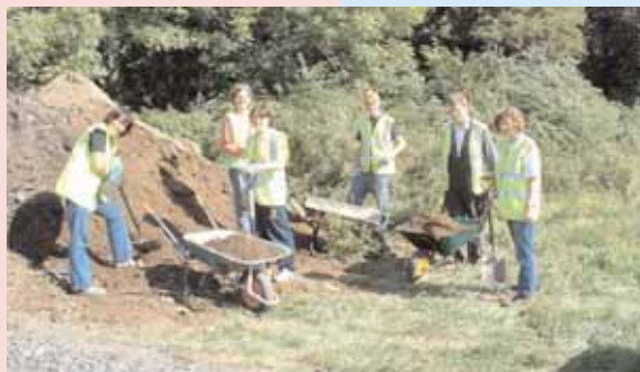
Volunteers and Sustrans staff working on the Penclawdd section of the award-winning National Cycle Network

Also see section on Food and Shopping to learn how we can reduce energy used in transporting goods.