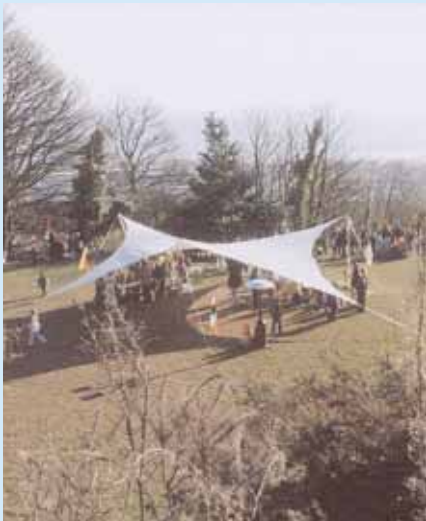
Rosehill Quarry Park

Rosehill Quarry Group was set up in the early 1980's by local residents determined to save Rosehill Quarry Park from development. This impassioned group were successful in persuading Swansea City Council to designate the area as a Public Open Space. As a result, the Park remains a haven for wildlife and for public enjoyment, nestling amongst dense housing. The Rosehill Quarry Group continue to manage the area for public recreation and to conserve its diverse wildlife. The Park has become a focus for local events, bringing people in the local community together. All local people are welcomed in planning and caring for the site.