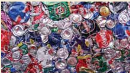
Aluminium can recycling bale