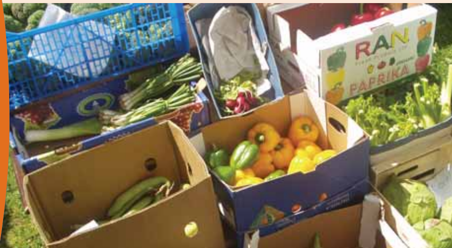
Penclawdd Produce and Craft Market

Swansea Indoor Market is also home to traders selling local produce. Supporting the small-scale traders here helps to support the local economy and retain a vibrant part of Swansea's heritage.