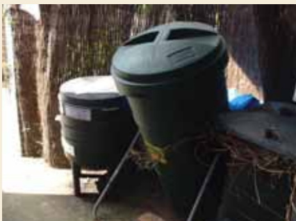
Compost demonstration area at the Environment Centre