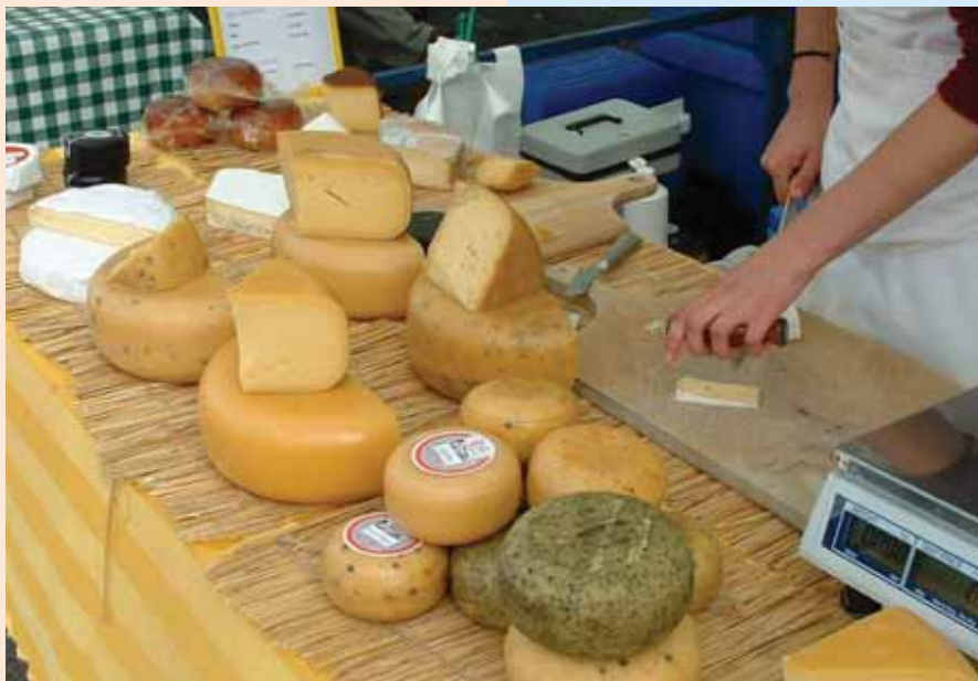
Mumbles Local Produce Market

Penclawdd Produce and Craft Market and Mumbles Local Produce Market sell a variety of produce such as cheese, bread, pastries, meats and vegetables. Both markets have been set up by Local Development Trusts who are partnerships of individuals and organisations working to improve the economic, social and environmental condition of the local area for everyone's benefit. See the section on Communities for information on Mumbles Local Development Trust and where to find other Trust.