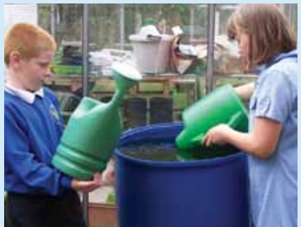
Children at Gors School collecting from their rain-water butts

Gors Community School is practicing water conservation every day. This has been inspired by the school's partnership with a school in Rajasthan, India. The school has compared their situation with that of Udaipur where the monsoons had failed for the last four years. Here in Wales we often take water supply for granted but this school has recognized that whilst we seem to have plenty of it, we need to conserve what we have. For example, putting a bottle into the toilet cistern reduces the amount of water used in flushing the loo. For more tips on saving water go to www.water-guide.org.uk