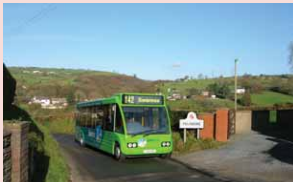
Travel around Swansea by bus

Bus it! – You could find it more relaxing than driving... no worries about parking and time on the bus to read. For bus times and information contact the Traveline Tel: 0870 608 2 608 or visit www.traveline-cymru.org.uk