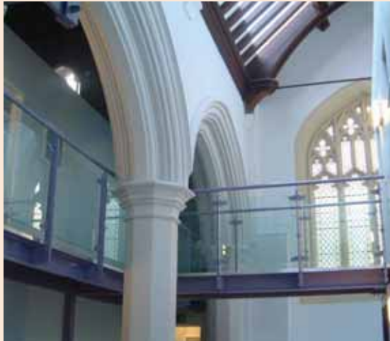
St John's Church, Hafod, Swansea

The Ethical Junction Network provides information on positively screened ethical companies, organisations, products and services, linking you through to the ethical, environmental and sustainability markets. www.ethicaljunction.co.uk