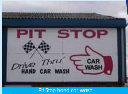
Pit Stop hand car wash

Customers are greeted by the friendly car wash team, known for their careful attention to detail and finishing. But behind the scenes there's a lot more going on.