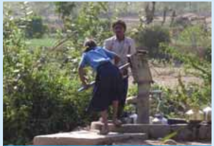
Children at the well in India

Remember that we are all connected to wetlands through our drains. Whatever goes down them eventually returns to the environment. Use environmentally-friendly household products and take spent oil to a recycling depot to reduce the potential of polluting the water.