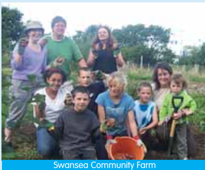
Swansea Community Farm

Swansea Community Farm is situated on 3.5 acres of previously derelict land in Fforestfach and provides opportunities for people of all ages and abilities to join in the life of a small working farm. It offers a wide range of activities for children and young people, including play schemes, weekend activities and an after-school club, while animal training, healthy living sessions and conservation can help towards Children's University qualifications. The Farm's award winning 'Farm Hands' adult volunteers project offers a range of practical activities and training most days of the week. School groups can enjoy a hands-on tour of the Farm's rare breed animals or discover the magic of composting through the "Turn with the Worm" half or full day programme.