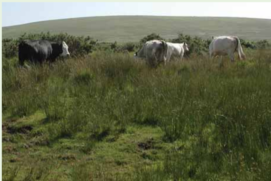
Gower Commons Initiative, Cefn Bryn Gower

To learn more about the importance of wetlands, go to page 32.