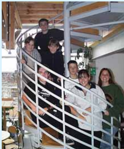
The Environment Centre

Please call Sustainable Swansea staff on 01792 480200 for more information on visiting places on the Trail.