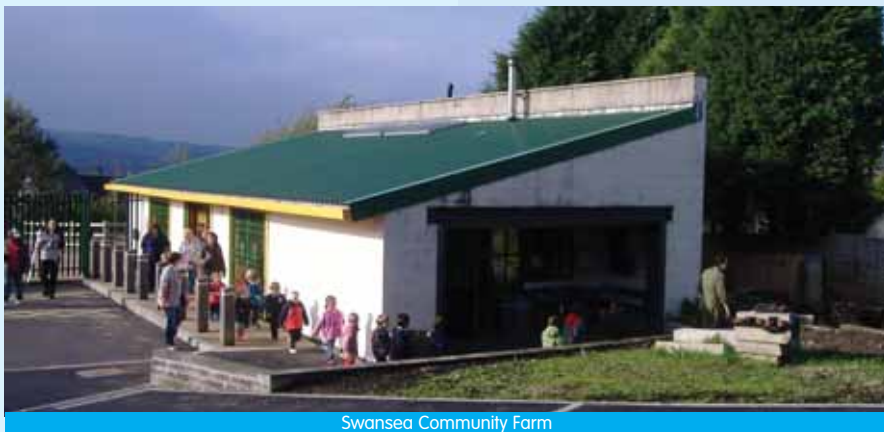
Swansea Community Farm

Swansea Community Farm has incorporated several energy efficiency features into their buildings. In the animal house and workshop, flax insulation has been used in the ceilings, walls and floors to reduce heat loss. This insulation is 100% natural, easy to install and economically and environmentally sustainable. Sun pipes allow natural light into the animal house, which has no windows, reducing the need to use artificial light. Double-glazing has been used to reduce heat loss. The window frames and all the wood in the building has been sourced from sustainably managed forests. The floors have been constructed using Margam slag (a local industrial by-product), thus reducing the energy used in transporting it and avoiding the need for newly quarried stone which would take more energy.