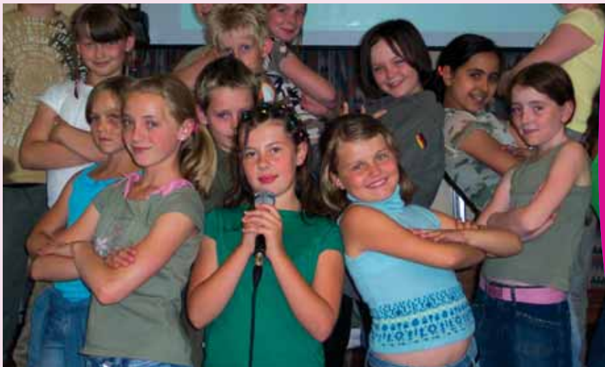
Gors Primary School