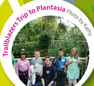
Trailblazers Trip to Plantasia