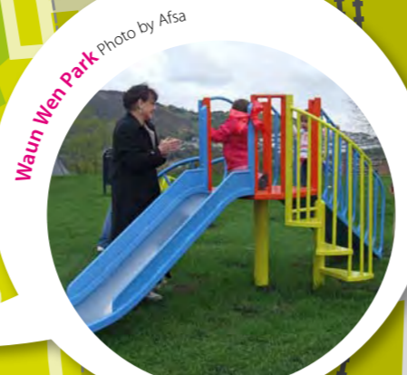
Wauw Wen Park