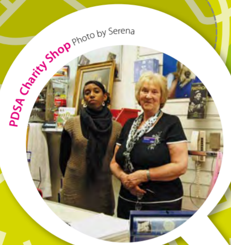
PDFA Charity Shop